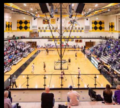
AVON HIGH SCHOOL