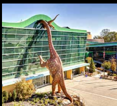
CHILDREN'S MUSEUM OF INDIANAPOLIS