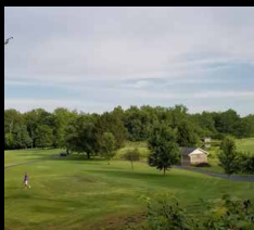
PRESTWICK COUNTRY CLUB