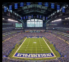
LUCAS OIL STADIUM