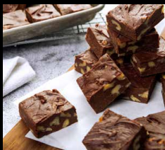
THE FUDGE KETTLE