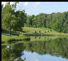
AVON TOWN HALL PARK