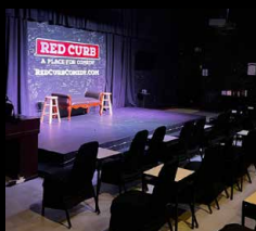
RED CURB COMEDY IMPROV CLUB