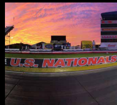
LUCAS OIL RACEWAY PARK