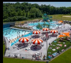
MURPHY AQUATIC PARK