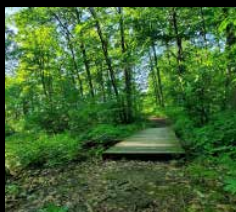
BURNETT WOODS NATURE PRESERVE